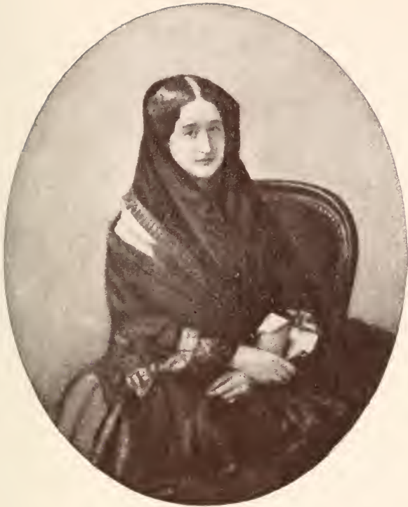
MADemoiselle Eugénie—COMTESSE DE TÉBA. From a photograph taken in 1852.